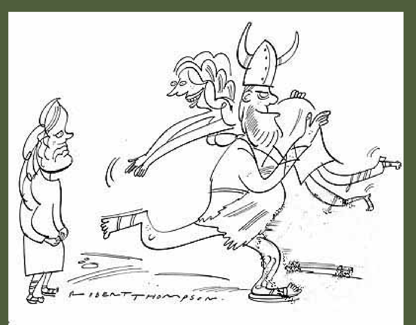
"Nordic but nice!"